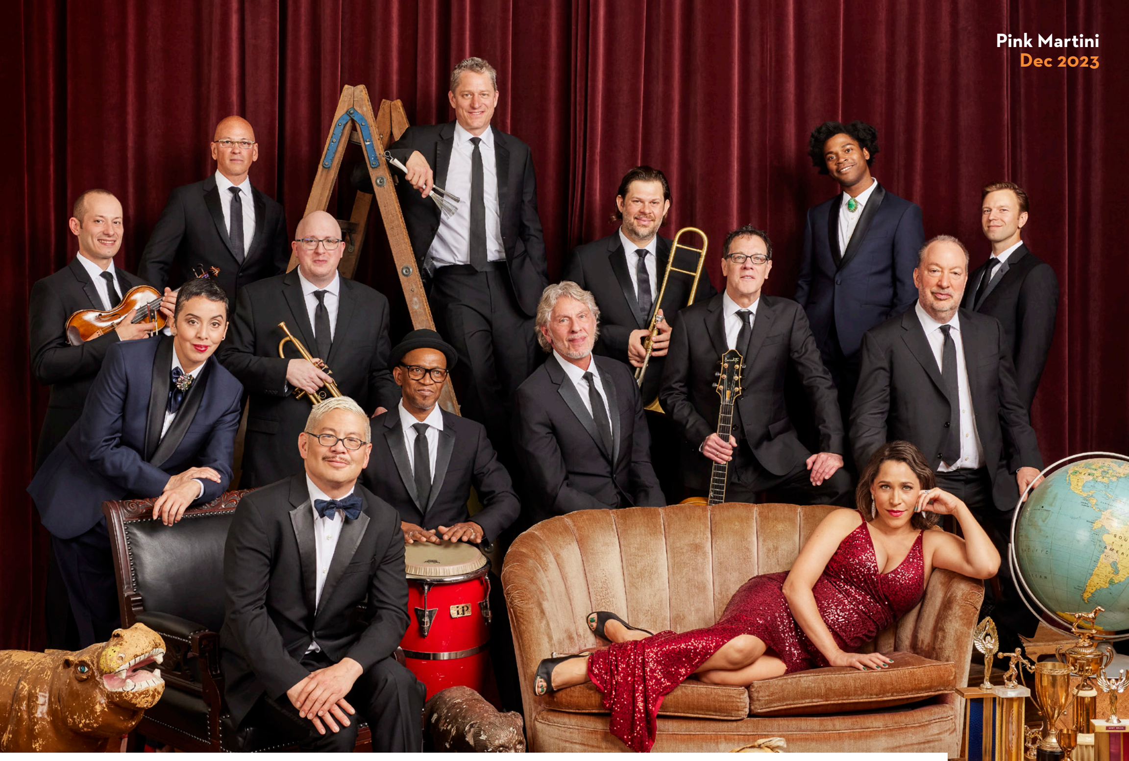
Pink Martini Dec 2023