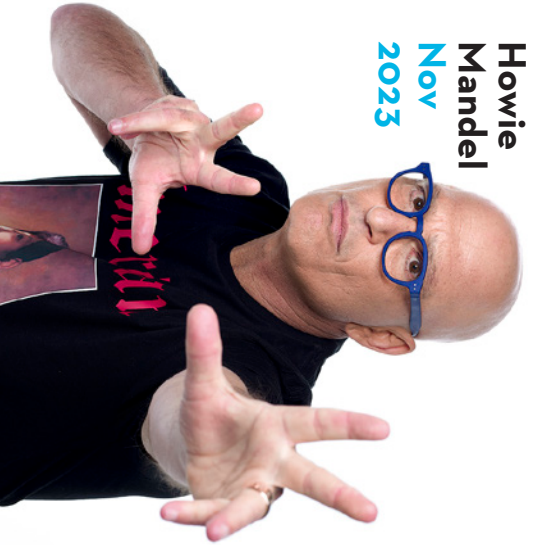
Howie Mandel Nov 2023

Chandler Cultural Foundation 250 NORTH ARIZONA AVENUE CHANDLER, ARIZONA 85225-4567