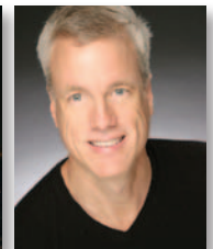
"That's Life" From Sinatra to Sondheim