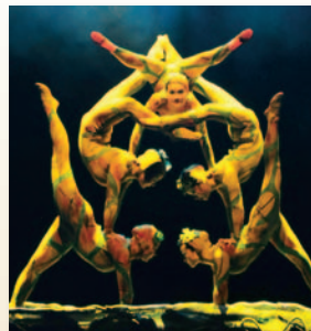
Cirque Shanghai Bai Xi