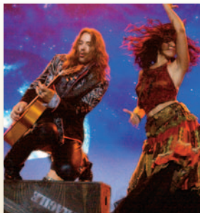
BENISE – The Spanish Guitar