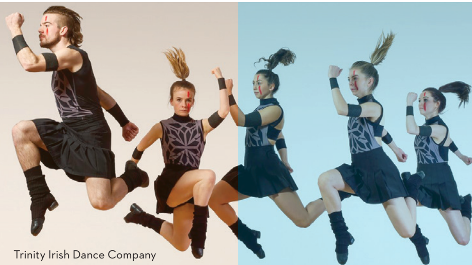
Trinity Irish Dance Company

*Join us for these performances in our intimate Hal Bogle Theatre